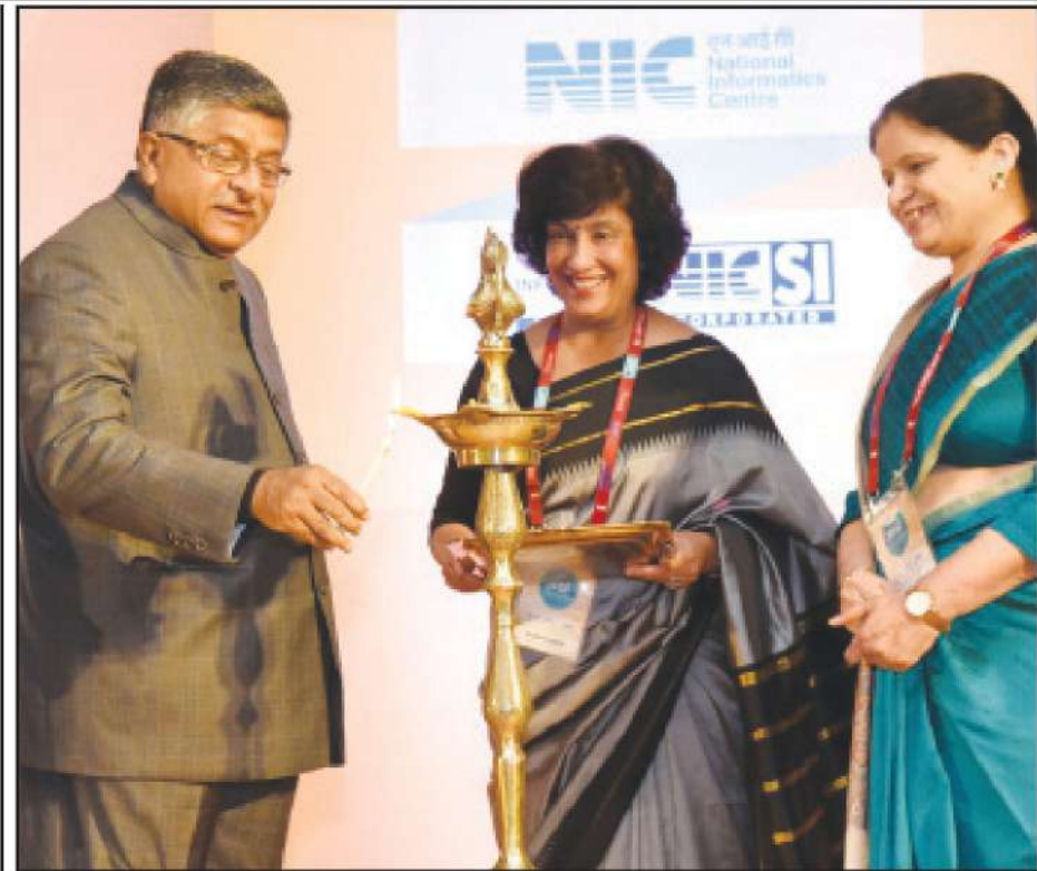
केन्द्रीय कानून और न्याय, संचार और इलेक्ट्रॉनिक्स और सूचना प्रौद्योगिकी मंत्री श्री रविशंकर प्रसाद ने नई दिल्ली में थीम - नेक्स्टजेन गर्वसेन के लिए टेक्नोलॉजीज के साथ Of एनआईसी टेक कॉन्क्लेव 2020 के उद्घाटन पर दीप प्रज्वलित किया।

के खिलाफ आईपीसी की धारा 147, 145, 188 और 352 के तहत ठाकुरगंज थाने में एफआईआर दर्ज करवाई है। नागरिकता संशोधन कानून के खिलाफ घंटाघर के बाद गोमतीनगर के उज्जियांव में गंज शहीदा कब्रिस्तान के पास स्थित दरगाह परिसर में दर्जनों की संख्या में महिलाओं ने प्रदर्शन शुरू कर दिया। प्रदर्शन की जानकारी मिलने के बाद पुलिस के आला अधिकारी मौके पर पहुंच गए। धरना समाप्त करने के लिए पुलिस काफी देर तक प्रदर्शनकारियों को समझाती रही लेकिन वे नहीं मानीं। दरगाह परिसर में बैठी महिलाओं और बच्चों ने सीएफ के खिलाफ नारेबाजी की। पुलिस ने एतराज जताते हुए घर जाने को कहा लेकिन महिलाएं अड़ी रहीं। उनका कहना है कि वे लोग इसी तरह से सीएफ का विरोध करती रहेंगी।