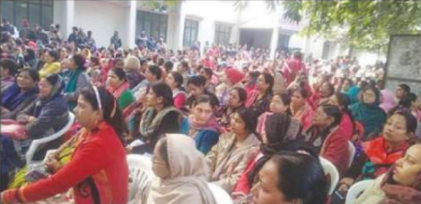
विरोध के चलते यहां सभा करने की अनुमति नहीं दी।

महालक्ष्मी ब्यूरो कानपुर, 21 जनवरी उत्तर प्रदेश शिक्षक महासंघ ने मंगलवार को जिला विद्यालय निरीक्षक कार्यालय में जोरदार प्रदर्शन किया। इसमें स्कूल का रीजन से छुट्टी लेकर हजारों शिक्षक शामिल हुए। शिक्षक सेवा सुरक्षा, वित्तविहीन शिक्षकों की सेवा नियमावली बनाने और प्रेरणा ऐप वापस लेने की मांग कर रहे थे। महासंघ की प्रदेश स्तरीय कॉल पर बड़ी संख्या में माध्यमिक और प्राथमिक शिक्षक दोपहर जिला विद्यालय निरीक्षक कार्यालय में एकत्रित हो गए इसमें मुख्य रूप से माध्यमिक शिक्षक संघ शर्मा गुट और प्राथमिक शिक्षक संघ शामिल है। हजारों की संख्या में पहुंचे शिक्षकों के कारण कार्यालय परिसर छेटा पड़ गया। बड़ी संख्या में शिक्षक सड़क पर भी एकत्रित रहे पहले यह प्रदर्शन राजकीय इंटर कॉलेज ग्राउंड पर होना था लेकिन पुलिस ने सीएफ के