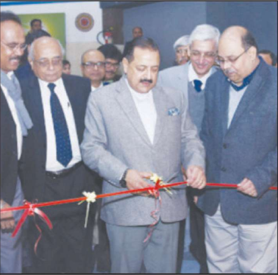
पूर्वोत्तर क्षेत्र विकास राज्य मंत्री, प्रधानमंत्री कार्यालय, कार्मिक, लोक शिकायत और पेंशन, परमाणु ऊर्जा और अंतरिक्ष, डॉ. जितेंद्र सिंह राष्ट्रीय विज्ञान केंद्र में मेगा विज्ञान प्रदर्शनी 'विज्ञान सम्मेलन' का उद्घाटन करते हुए।