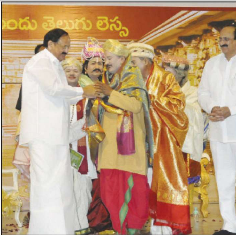
The Vice President, Shri M. Venkaiah Naidu felicitating the artists who performed 'Bhuvana Vijayam', a unique artistic rendering showcasing the best of Telugu classical poetry, at Swarna Bharat Trust, in Nellore.

and businesspersons are also facing acute harassment. We once again appeal to the protesters at Shaheen Bagh to clear the road and restore normal traffic," the department said in Twitter. The Delhi Police on Friday appealed to agitators to unblock the Kalindi Kunj-Shaheen Bagh stretch due to which the residents of Delhi and NCR are suffering, officials said.