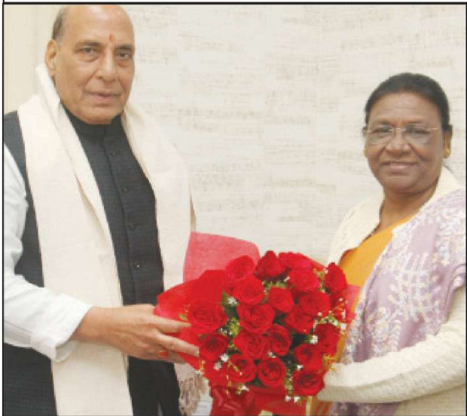
The Governor of Jharkhand, Smt. Draupadi Murmu calling on the Union Minister for Defence, Shri Rajnath Singh, in New Delhi.