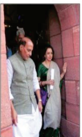
Rajnath Singh with Hema Malini at Parliament on Wednesday.

Sharma said the Modi government scrapped the 2005 deal signed during the UPA regime for purchase of 126 jets at a rate of Rs 526 crore each and inked a fresh pact in 2015 to purchase 36 jets at a much higher rate of Rs 15,070 crore each. Sharma said, "The Presidential address did not have anything on foreign policy or problems with China, the situation in Nepal or Maldives, but just mentioned old schemes without talking about the ground reality." Hitting back at BJP President Amit Shah, who had said that Congress left nothing in heritage to the current government, Sharma highlighted steps taken by former Prime Ministers Jawaharlal Nehru, Indira