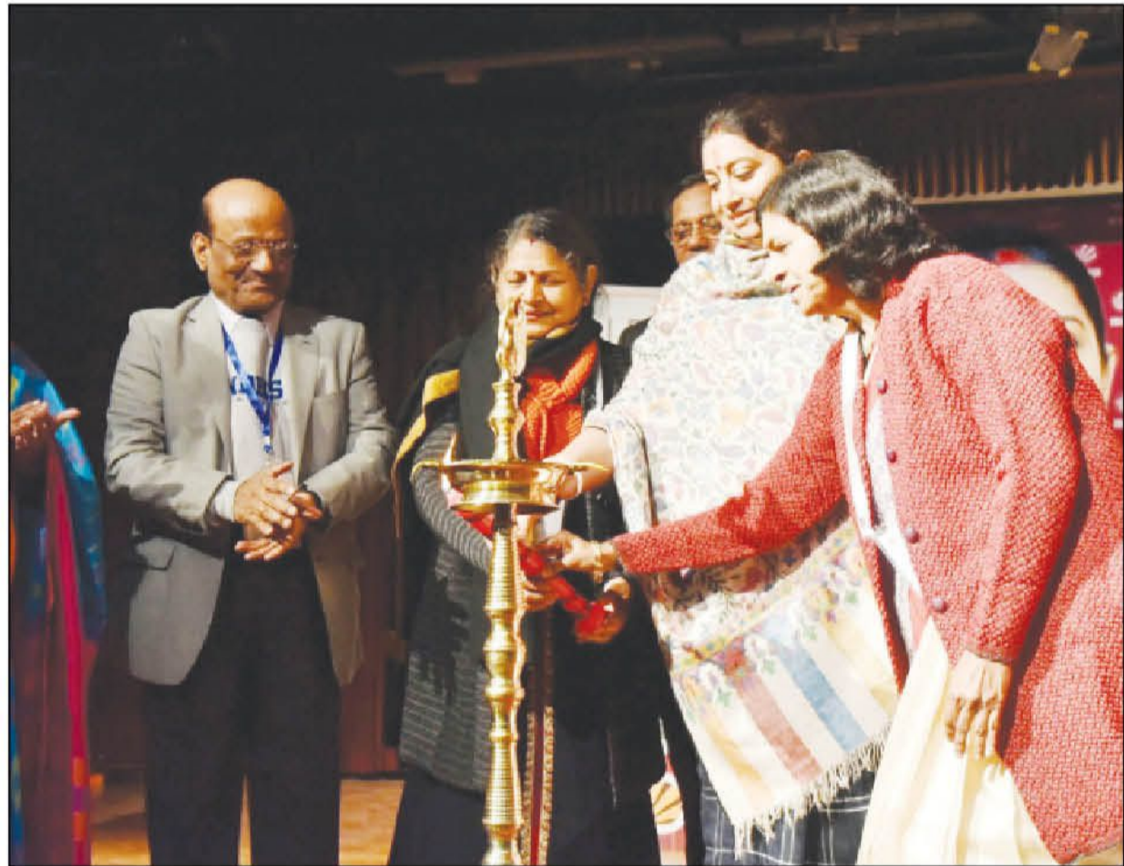
The Union Minister for Textiles, Smt. Smriti Irani lighting the lamp to inaugurate the Women science Congress, during the 106th Indian science Congress, in Jalandhar Punjab.