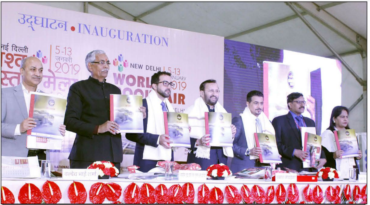
The Union Minister for Human Resource Development, Shri Prakash Javadekar releasing the Catalogue of Braille books, published by NBT, at the inauguration of the New Delhi World Book Fair, at Pragati Maidan, New Delhi.

The senior lawyer said he refrained from being actively involved in politics through AAP for over a year. "A year ago, I had resigned as leader of opposition in the Punjab assembly to devote full time to the anti-Sikh riot cases. I had resigned as an MLA too, although the Speaker.